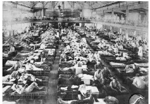
The WW1 base hospital at Etaples